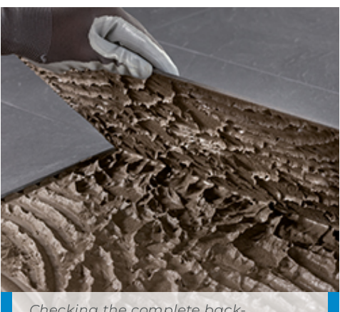
Checking the complete backbuttering of thin porcelain tile